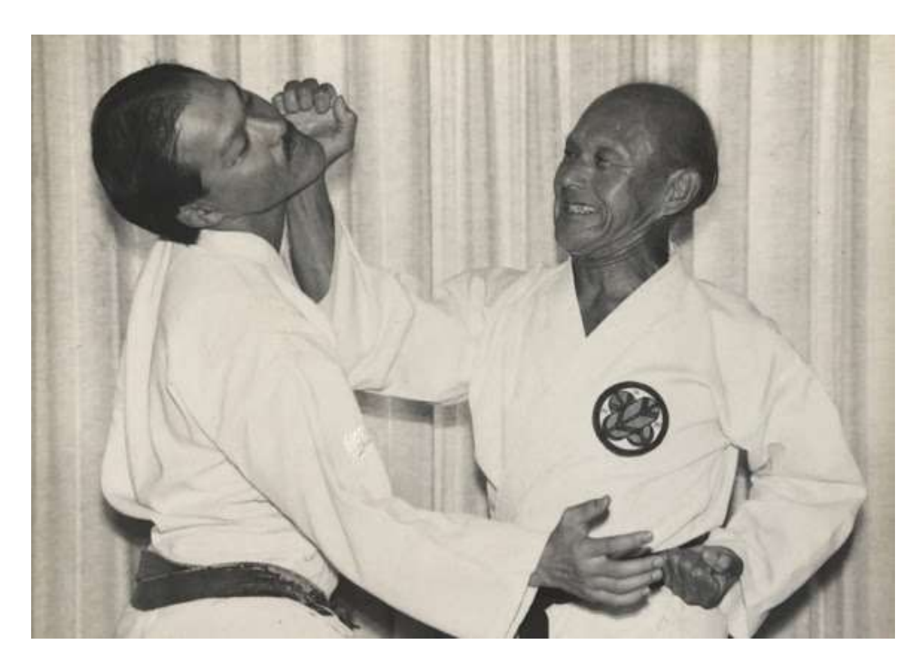
CONGRATULATIONS, POP!! SUPER PROUD OF YOU!!!